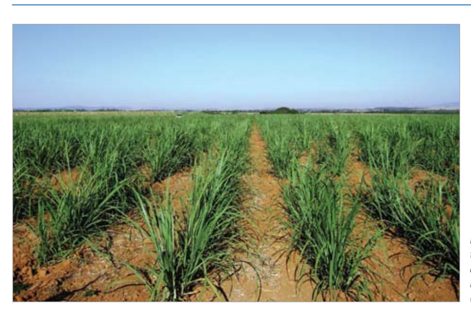
Figure 1. Overview of a field assay to evaluate cultivars under water deficit conditions of.

Center of Nuclear Energy in Agriculture / University of São Paulo (CENA/USP)