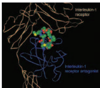
Peptides identified by phage display suggest a prominent role for interleukin-1 and family members in the pathogenesis of rheumatic fever

Immune recognition of self and non-self relies on the molecular biodiversity among other factors. Proteins and peptides are important components and orchestrators of this process, helping and guiding the cellular and humoral repertoire of our immunological system to distinguish between self and pathogenic. However, several diseases originate due to an imbalance in this intricate network of immune cells, antibodies and cytokines. Combinatorial technologies, such as phage display, are formidable tools to probe and investigate such disorders. Due to its high throughput and unbiased nature, peptide phage display libraries